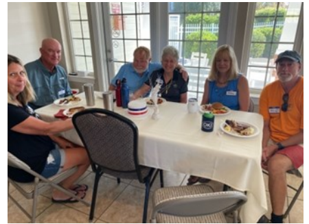
The August SHV Social was a pool party and was held outside by the pool. Hot dogs and dessert were supplied by the Social Committee.